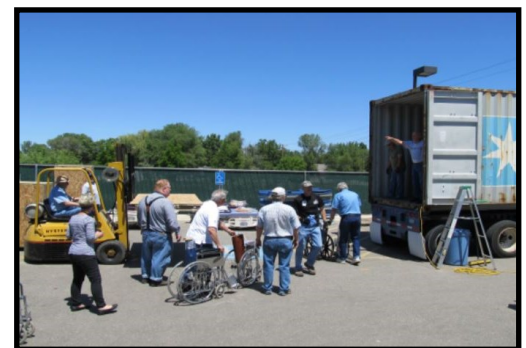
Wheelchairs on their way to Guinea

Check out our NEWLY REDESIGNED WEBSITE to view the latest news. www.handsofopenw.org