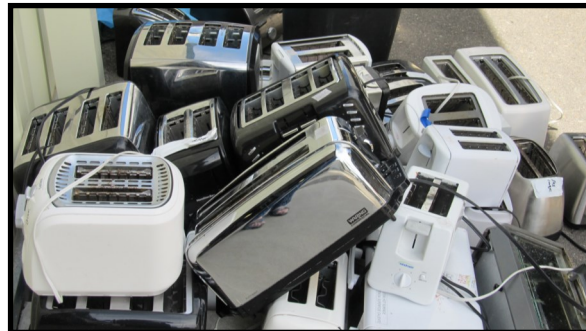
Thirty-nine toasters donated by a hospital!